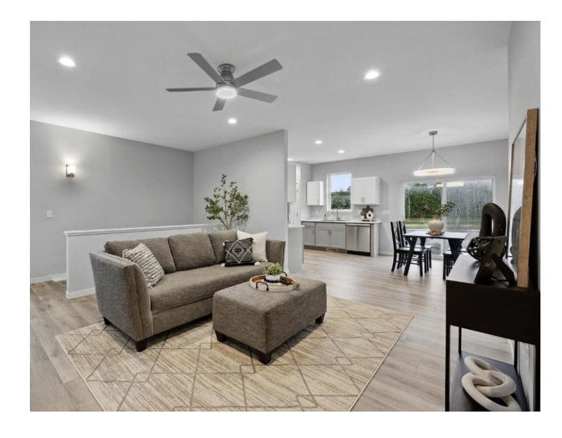
Photos representative from similar PRK Williams Building Group's Home Collection