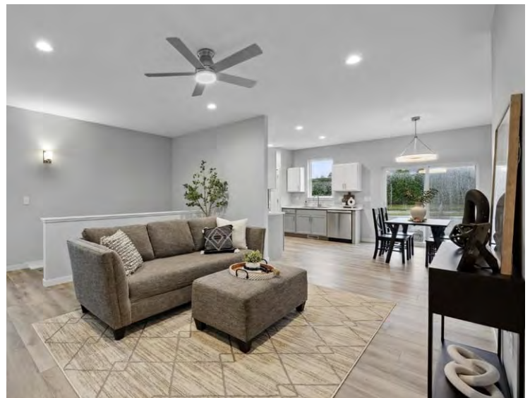
Photos representative from similar PRK Williams Building Group's Home Collection