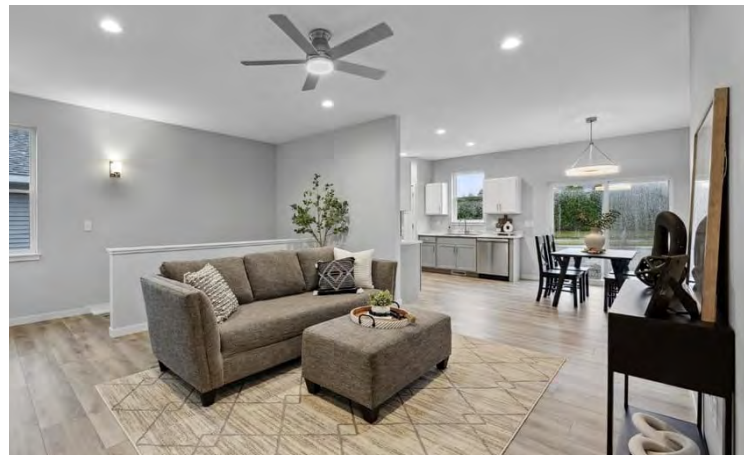
Photos representative from similar PRK Williams Building Group's Home Collection